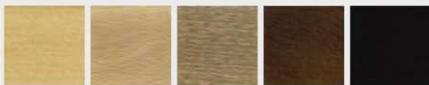
Natural Limed Oak Weathered Oak American Walnut Dark