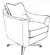
Swivel Chair H:89cm/35ins W:79cm/31ins D:94cm/37ins