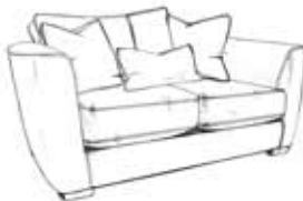
2 Seater H:88cm/35ins W:173cm/68ins D:102cm/40ins