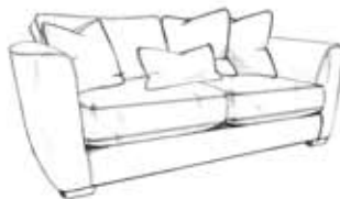
3 Seater H:88cm/35ins W:203cm/80ins D:102cm/40ins