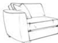
End Unit LH (available RH) H:88cm/35ins W:102cm/40ins D:102cm/40ins