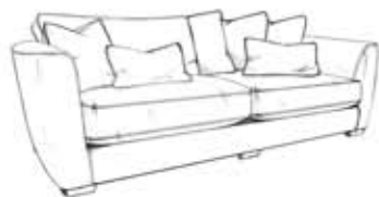
4 Seater (available split) H:88cm/35ins W:224cm/92ins D:102cm/40ins

Spencer St, Castlebar, Co. Mayo, 094 9022500 sales@mcdermotts.ie www.mcdermotts.ie