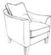
Accent Chair H:89cm/35ins W:79cm/31ins D:94cm/37ins