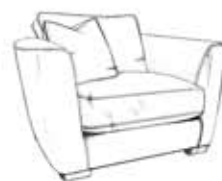
Chair H:88cm/35ins W:99cm/39ins D:99cm/39ins