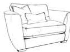
Snuggler H:88cm/35ins W:122cm/48ins D:102cm/40ins