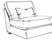
Single Unit H:88cm/35ins W:81cm/32ins D:102cm/40ins