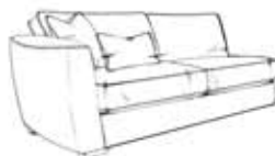
Large End Unit LH (available RH) H:88cm/35ins W:196cm/73ins D:102cm/40ins