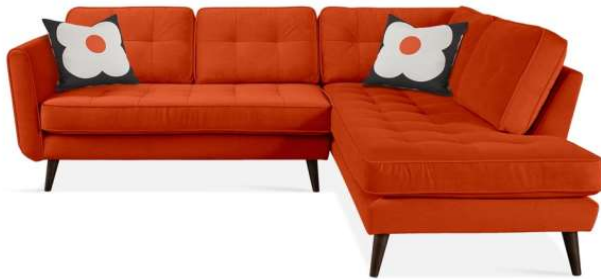
Ivy Corner Group Left

Range shown in Glyde Tomato, American Walnut coloured feet & Giant Abacus Red Cushions