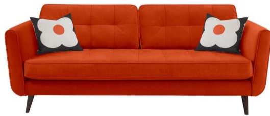
Ivy Large Sofa