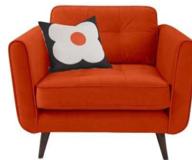
Ivy Standard Chair