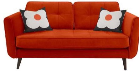
Ivy Small Sofa