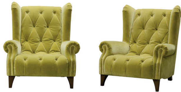
HIGH BACK CHAIR SHOWN IN BIBA MUSTARD FABRIC WITH GOLD STUDS W: 93cm H: 104cm D: 112cm

High backed modern vintage look. Designed for the ultimate comfort experience with the perfect deep buttoned sit and lots of attention to detail.