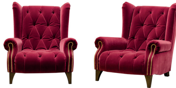
HIGH BACK CHAIR SHOWN IN BIBA BERRY FABRIC WITH GOLD STUDS W: 93cm H: 104cm D: 112cm